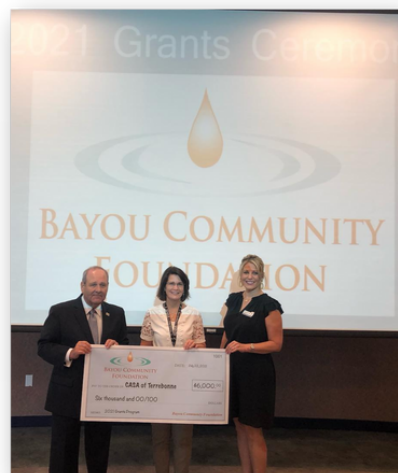
Bayou Community Foundation Grant Ceremony