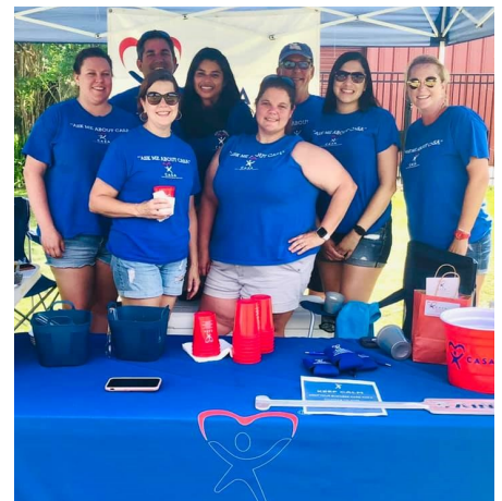
Pictured above: Staff and board members enjoying the day.

THANK YOU to Houma Invitational Oil Golf Tournament. CASA is a recipient of a portion of the proceeds from their event.