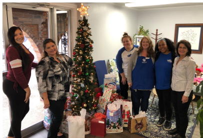
Junior Auxiliary of Houma