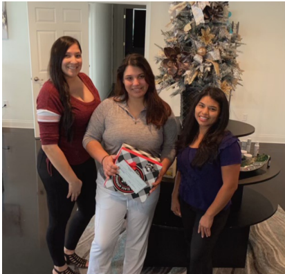
The Zen Den Health & Wellness

We are overwhelmed by the generosity that was shown towards our program this holiday season! We want to thank every individual, family, company, and organization that donated gifts and monetary donations to CASA of Terrebonne.