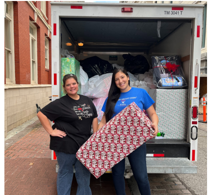
LA Bar Foundation