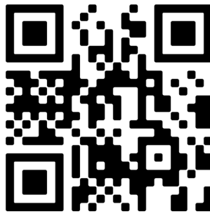
Loverboy Recruitment Video (Adult)