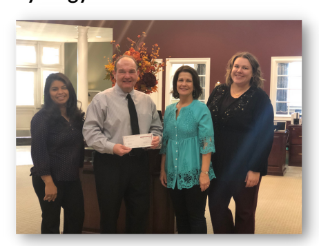
Synergy Bank Donation