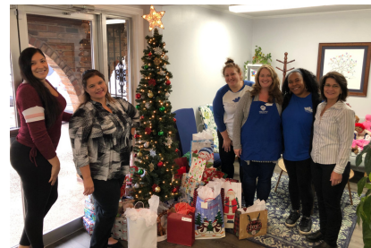
Junior Auxiliary of Houma