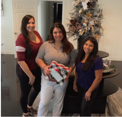
The Zen Den Health & Wellness

We are overwhelmed by the generosity that was shown towards our program this holiday season! We want to thank every individual, family, company, and organization that donated gifts and monetary donations to CASA of Terrebonne.