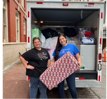
LA Bar Foundation